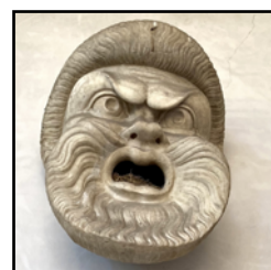
Photo of an abandoned bird's nest in the mouth of a large stone sculpture of a human face hanging on the wall of "Michelangelo's Cloister" in the Museo Nazionale Romano in Rome, Italy.