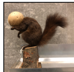
Photo of a squirrel that died after getting its head stuck in a ball. This taxidermy specimen is stored in the Det Grønne Museum in Auning, Denmark.