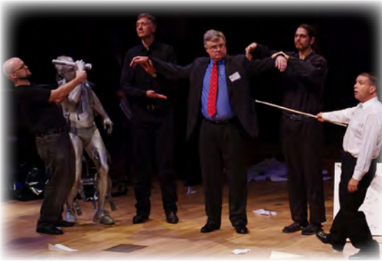
Galileococcus uses a mock-up to show his fellow bacteria what a human being looks like and which portions of it are good habitats for bacteria.