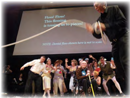
Flossing overcomes the bacteria.

It's just the residue. Life here will struggle on without us, without us. Scre-e-e-ew you, you residue! Now let us make our getaway! Cast the past away— Far, far, far, far away! Throw the old life away! Throw it all away! Throw it all away! Scrape the old life away! Scrape the life away! Brush the old life away! Brush the life away! Scrub, scrub the old life away! Scrub it all away! Scrub it away! Rinse it away! Yes—flush everything... Flush everything away! Flush everything away!