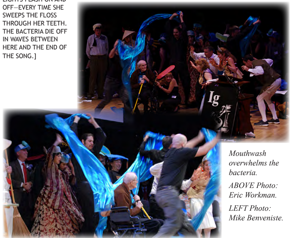
Mouthwash overwhelms the bacteria.

[ALL THE BACTERIA ARE NOW DEAD. THE WOMAN STANDS, SMILING, STRETCHING JOYOUSLY, AND NOW FULLY AWAKE. FOR HER IT'S JUST THE START OF ANOTHER DAY.]