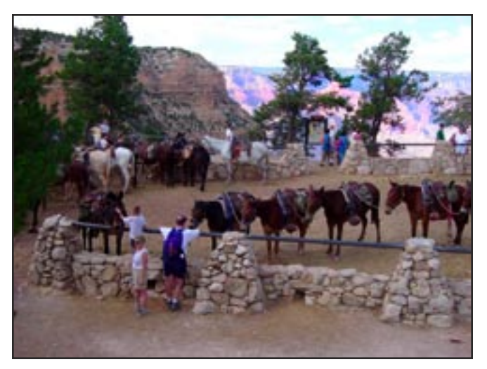
"Evolution of thought. Mules contemplate man's mismeasure of the grandness of Grand Canyon."